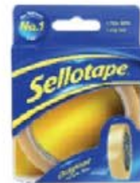
SELLOTAPE & DOUBLE SIDED